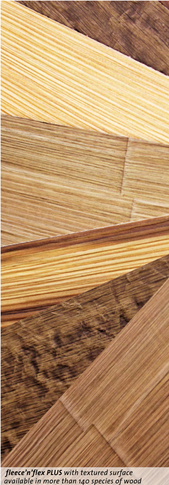
fleece'n'flex PLUS with textured surface available in more than 140 species of wood