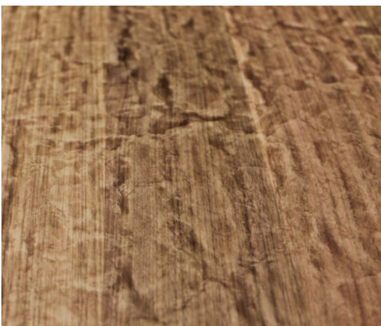
fleece'n'flex PLUS (bark)