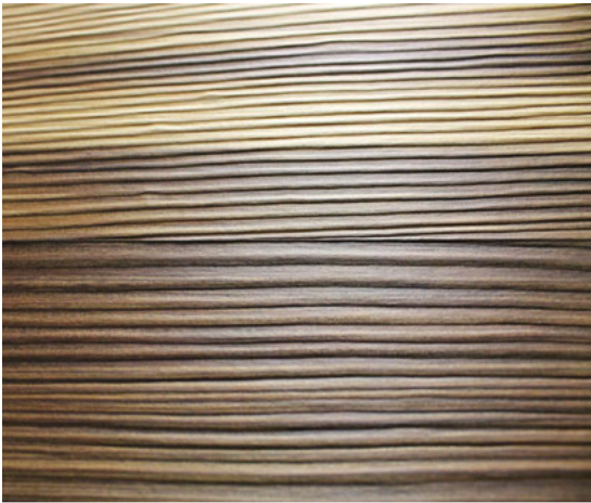
fleece'n'flex PLUS (brushed)